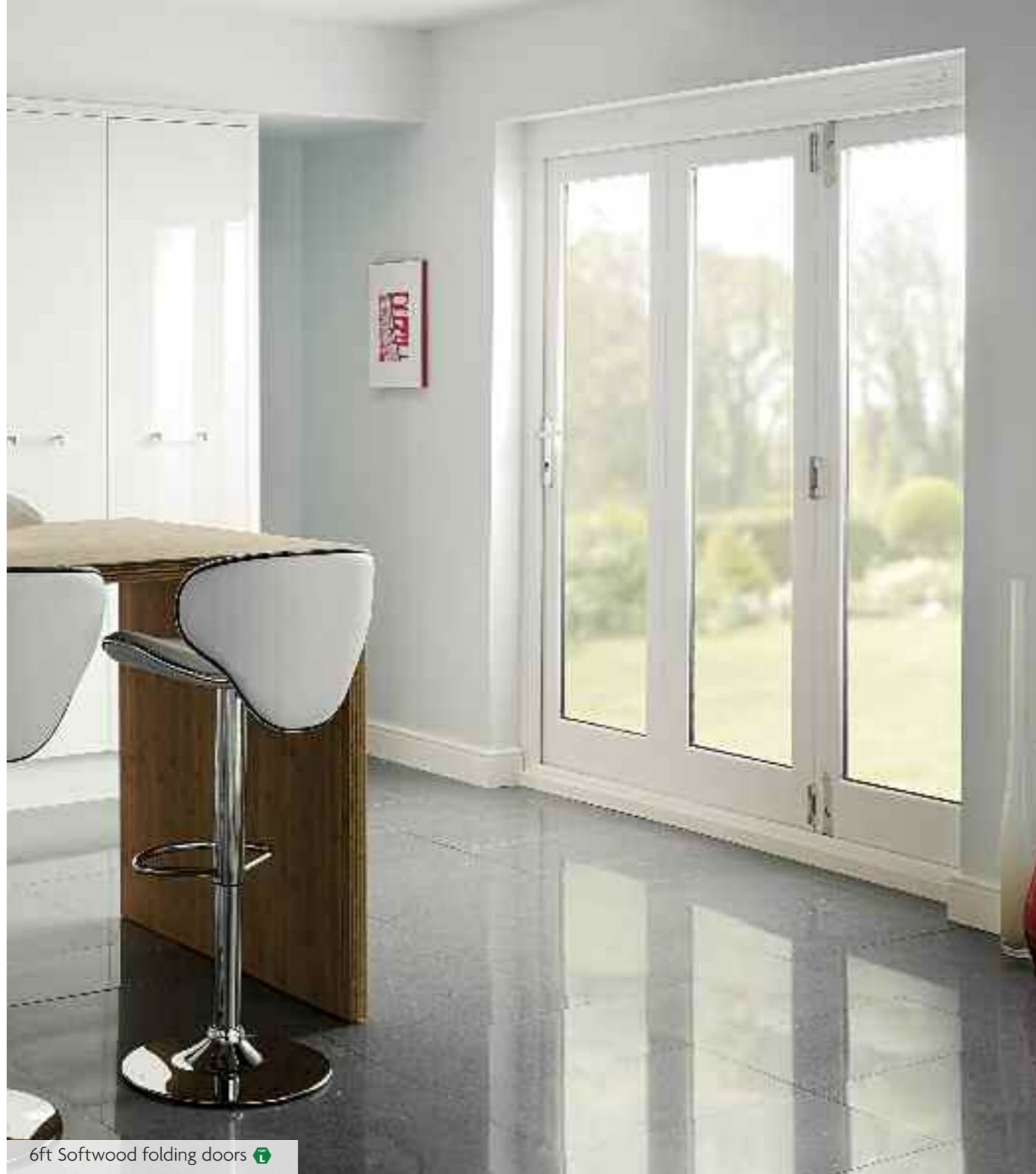
6ft Softwood folding doors