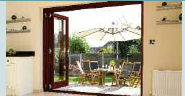
Also available in 8ft, 10ft and 12ft widths.

Made to the same exceptional standards as our solid oak folding doors and also available in 6 foot, 8 foot, 10 foot and 12 foot lengths or made to measure, the hardwood range provides an even more affordable option. Our hardwood doors are made using Sapele, and once again the sturdy 55mm sections provide a reassuringly solid feel. With energy saving double glazed units as standard, our folding doors are as up to the minute in performance as they are in design.