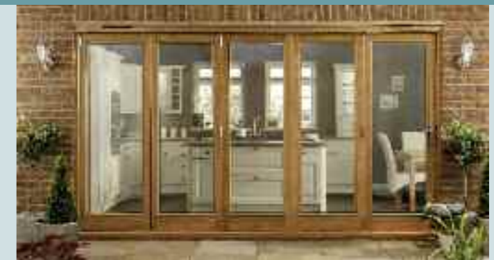
Also available in 6ft, 8ft and 10ft widths.

* This finish is only available on Solid Oak.