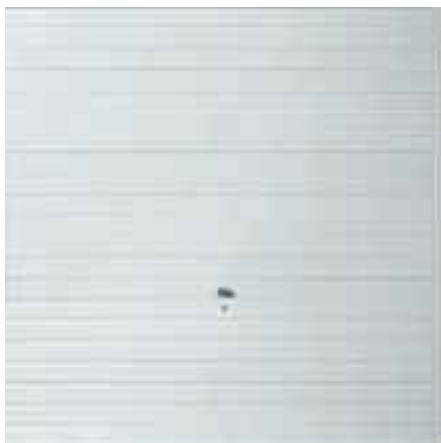
PREMIERE RANGE MERLIN