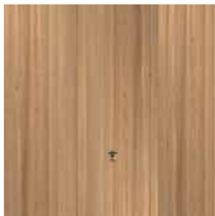
TIMBER DOORS BERGEN