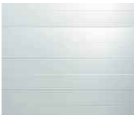
g60 SECTIONAL GARAGE DOORS TREND