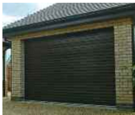
ROLLER DOORS SINGLE SKIN

The g60 door is available in 4 styles; White, Brown, Woodgrain and RAL colours.