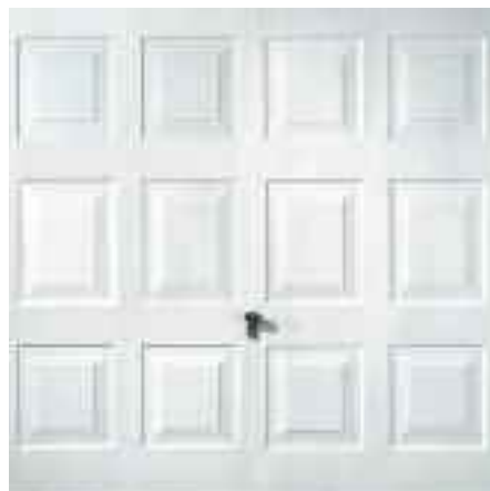
PREMIERE RANGE CORINTHIAN