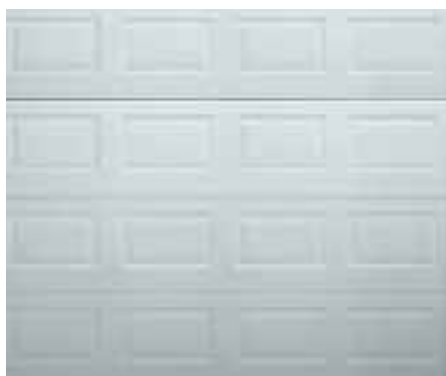
g60 SECTIONAL GARAGE DOORS GEORGIAN