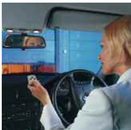
REMOTE CONTROL ULTRA OPERATORS